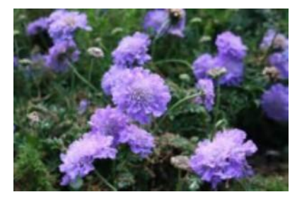
Scabieuse colombaire Pincushion Flower